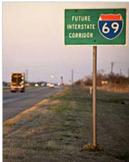
Near Victoria, Tex., a sign announces the coming of Interstate 69, which is now listed as part of a major state highway project.