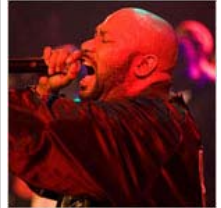
Houston's Hip-Hop Scene Picks Up the Pieces