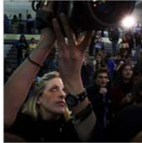
Putting Candidates Under the Videoscope