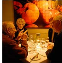
36 Hours in Napa Valley