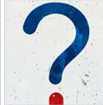
Making Sense of the Great Suicide Debate