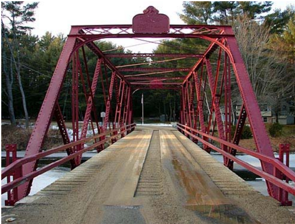
Iron bridge over Crooked River on Ryefield Bridge Road, Otisfield Gore, Maine

April 8, 2008 -- AUGUSTA – Responding to growing concern over the condition of bridges around the State and to a November 2007 study, “Keeping Our Bridges Safe,” Maine Governor John E. Baldacci today submitted bipartisan legislation that will invest an additional $160 million over four years in bridge construction and preservation.